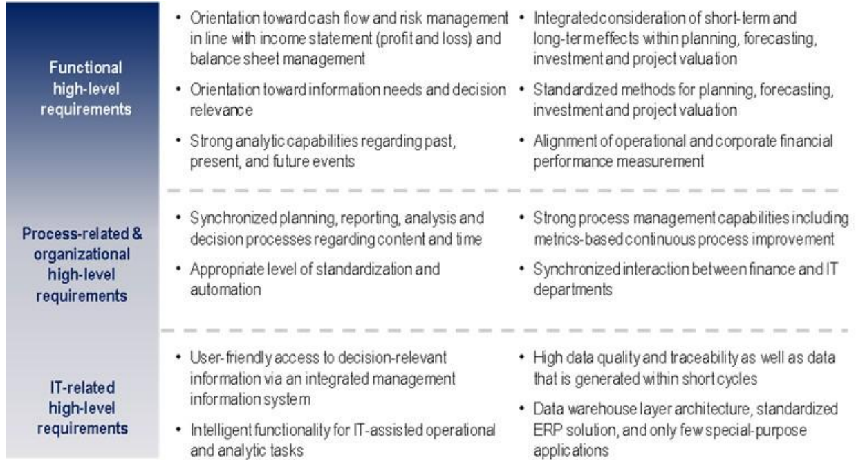
Figure 2. High-level Requirements of the Finance IT Target Setup

As a theoretical lens, we relied on value-based management and related disciplines such as business process management, business intelligence, and corporate performance management to cover all involved enterprise architecture layers. We chose value-based management as our guiding paradigm as it emphasizes cash flow, future, and risk orientation (e.g., Rappaport, 1986). Value-based management directly affects corporate activities such as risk management, cash flow management, investment and project valuation, planning and forecasting; it also affects the interfaces of these activities that one uses to operational finance services (e.g., Aretz & Bartram, 2010; Hahn & Kuhn, 2012; Malmi & Ikäheimo, 2003). All these activities were important for Infineon's financial management activities and, thus, for the finance IT setup. Our choosing value-based management was in line with the aspirations of Infineon's financial management department. In the workshop in which the financial management department identified the need for transforming Infineon's finance IT setup, it also decided to strengthen its cash flow, future, and risk orientation. Thus, in line with the objectives of Infineon's financial management department, we chose value-based management as a perspective to promote organizational transformation.